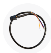
0.35 m 4pin Automotive adapter cable