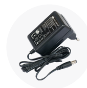
24V 0.8 A power adapter