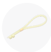
2x plastic straps